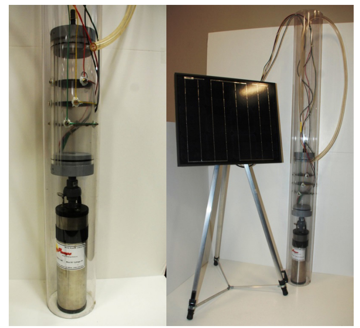
Alshawabkeh and his team have created a pilot-scale electrochemical setup to test the influence of different parameters on removal of TCE from groundwater.

Researchers were able to show efficient removal of TCE using a simple, two-electrode system. The two electrodes, or electrical conductors, are referred to as the cathode and anode, which donate and accept electrons, respectively, from the surrounding groundwater. This movement of electrons leads to oxidation of surrounding compounds, or loss of electrons, at the anode and reduction, or gain of electrons, at the cathode, which have both been previously shown to dechlorinate TCE.