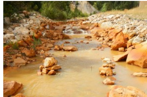
AMD contamination of the North Fork of Clear Creek turned rocks and pebbles orange, in addition to adding metals and sediments.

In a similar set of experiments, the team sought to understand how metals affected algae colonization and growth on stream substrate, normally rocks and pebbles in the field. The team deployed white tiles in the field downstream of the AMD sources for one year before the treatment plant became operational. After becoming coated with particulate metals, the team brought the tiles back to the lab and allowed algae to colonize them using the mesocosm experiments. To compare the effect of substrate color on algae, they also used white, cinnamon- and pumpkin-colored tiles, reflective of the orange-tinted substrate in AMD-affected streams, with unpolluted water and measured algae colonization and growth.